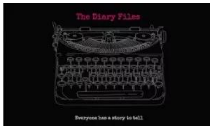
State Library New South Wales – The Diary Files