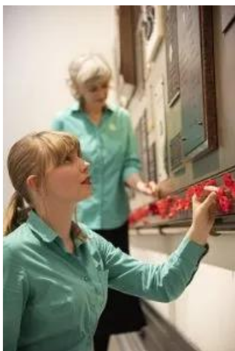
State Library Queensland – ANZAC stories